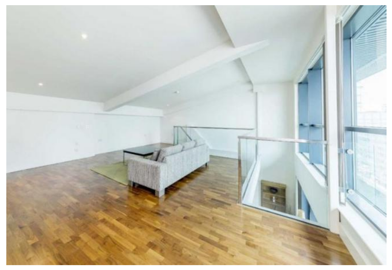
Discovery Dock Apartments East, 3 South Quay Square, London E14 9RZ

The highly sought after Development that is Discovery Dock West. Located a stone's throw from the Canary Wharf estate this development benefits from superb transport links with both tube, DLR and future Crossrail stations all within immediate walking distance. Discovery Dock West is a luxury development that offers the elite lifestyle that working professionals demand their busy lives. The development offers 24-hour concierge and is moments from the vibrant bars, restaurants and cafes Canary Wharf offers in addition to it's fantastic Jubilee Shopping Centre. The apartment itself offers a high specification throughout. The open plan reception benefits from a beautifully dark engineered wood flooring that includes underfloor heating. Additionally, the reception incorporates a fully integrated kitchen that benefits from top of the range appliances. Both bedrooms are bright and airy and include adequate space for storage, with the master bedroom also including a shower en-suite. Additional benefits include storage, secure parking, residents gym, swimming pool.